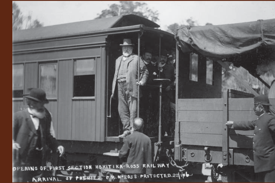
NZ Premiere, Richard John Seddon, arrives at the opening of the first section of the Hokitika-Ross railway, 22 January 1906.

The historic Mahināpua Creek Bridge, next to State Highway 6, was built as part of the Hokitika-Ross railway line and is one of only three wooden truss bridges remaining on the West Coast. The railway was built to connect the growing timber and tourism industries of South Westland and Hokitika with the east coast, and to encourage further settlement on the West Coast. Once the railway opened, the lake was no longer required for commercial transport.