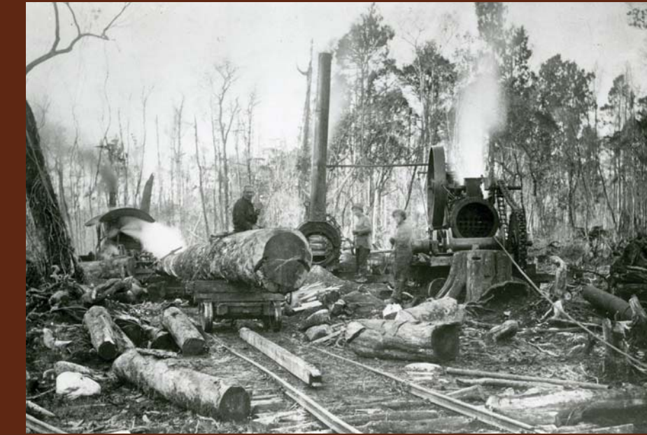
Davidson steam winch in West Coast bush. These winches were used to haul logs through the bush for the sawmilling industry.

The railway opened up the dense timber stands on the coastal terraces to saw millers. By the early twentieth century the area near Hokitika had become an important sawmilling area, second only to the Arnold Valley near Greymouth. Although the stands of trees near the beach and railroad were felled early on, the remaining forest was designated a scenic reserve in 1907, conserving the important native wildlife and plants around the lake.