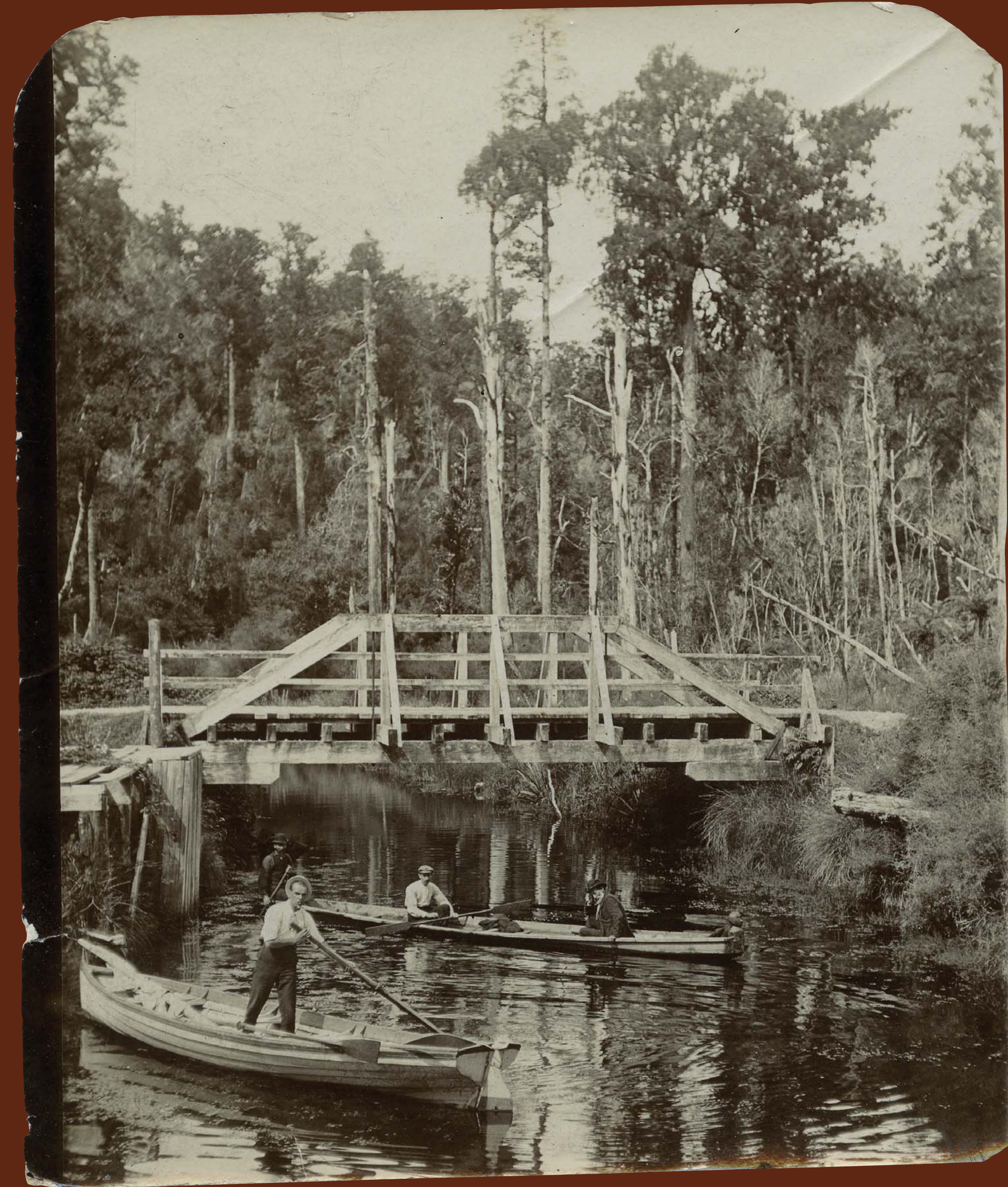
Fishermens Creek, Lake Mahināpua. Stereoscope photo. Men in boats with a wooden bridge behind.