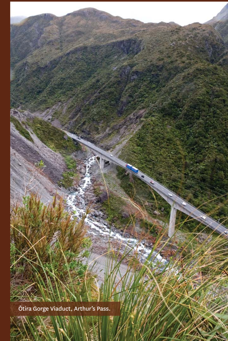
Ōtira Gorge Viaduct, Arthur's Pass.

Arthur's Pass has been subject to closures from landslides and avalanches. The most unstable section was replaced with the Ōtira Viaduct, a 440m long and 35m high viaduct that took 11 years to construct. Ōtira Viaduct opened in 1999.